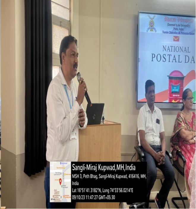
Sangli-Miraj Kupwad, MH, India MSH 3, Peth Bhag, Sangli-Miraj Kupwad, 416416, MH, India Lat 16°51'41.3182"N, Long 74°33'56.0214"E 09/10/23 11:47:27 GMT+05:30