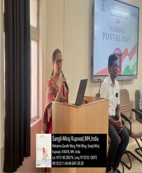
Sangli-Miraj Kupwad, MH, India Mahatma Gandhi Marg, Peth Bhag, Sangli-Miraj Kupwad, 416416, MH, India Lat 16°51'40.2952"N, Long 74°33'53.1283"E 09/10/23 11:44:46 GMT+05:30