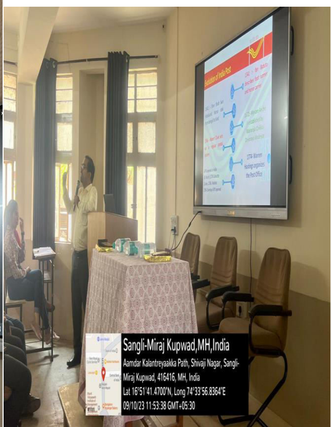
Sangli-Miraj Kupwad, MH, India Aamdar Kalantreyakka Path, Shivaji Nagar, Sangli- Miraj Kupwad, 416416, MH, India Lat 16°51'41.4700"N, Long 74°33'56.8364"E 09/10/23 11:53:38 GMT+05:30