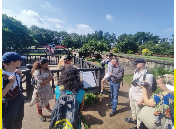
Joint Summer School session at University of Cologne and Bharati Vidyapeeth (Deemed to be) University.