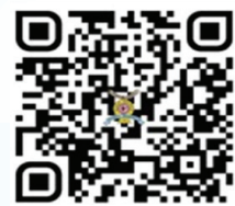
CET Application QR Code