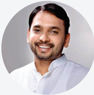
Hon. Dr. Vishwajeet Kadam Secretary, Pro Vice Chancellor