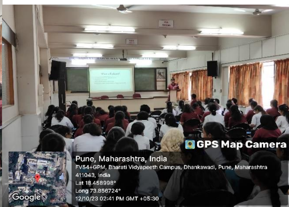
Intern Nikhil explaining Epilepsy