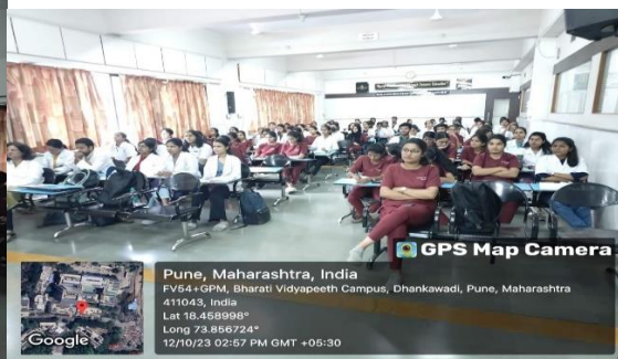
Interns and PG at clinical session