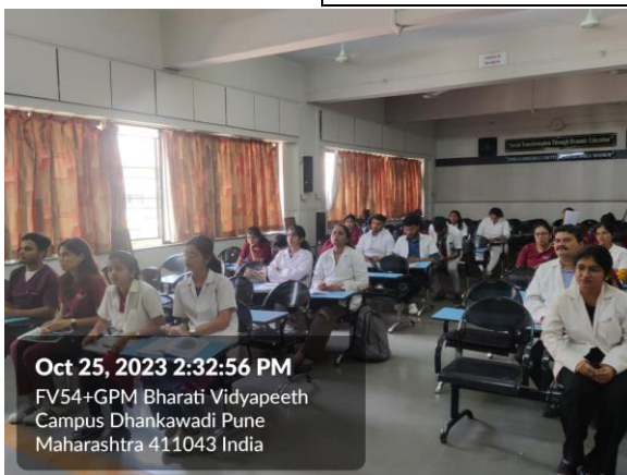
Faculty and interns attending session