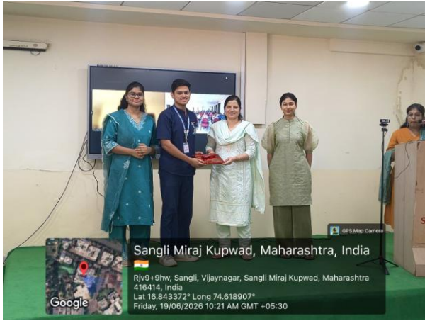
Sangli Miraj Kupwad, Maharashtra, India

Rjv9+9hw, Sangli, Vijaynagar, Sangli Miraj Kupwad, Maharashtra 416414, India Lat 16.843414° Long 74.618946° Friday, 19/06/2026 09:59 AM GMT +05:30