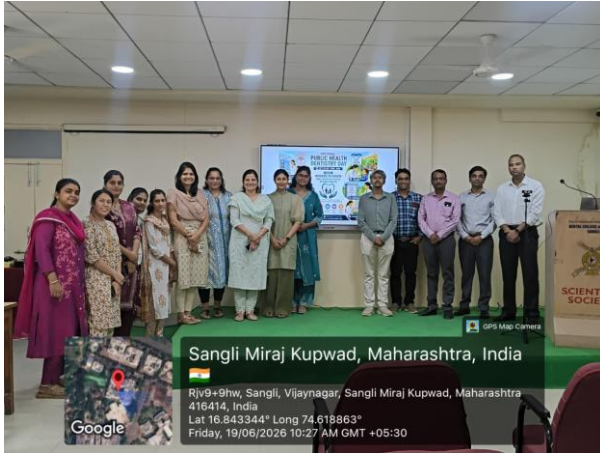
Sangli Miraj Kupwad, Maharashtra, India

Rjv9+9hw, Sangli, Vijaynagar, Sangli Miraj Kupwad, Maharashtra 416414, India Lat 16.843344° Long 74.618863° Friday, 19/06/2026 10:27 AM GMT +05:30