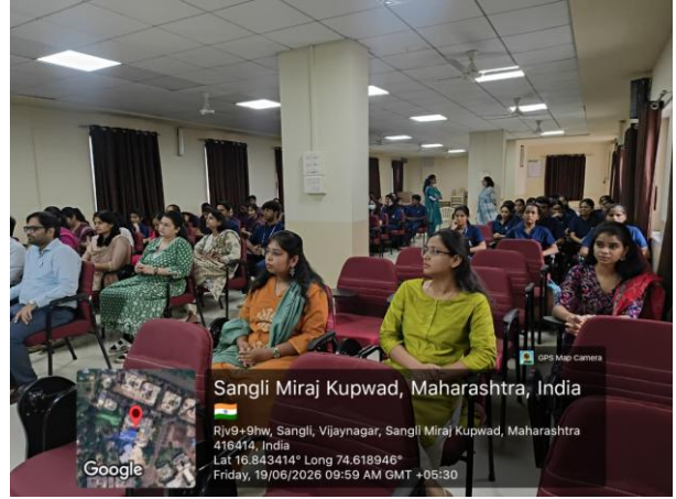
Sangli Miraj Kupwad, Maharashtra, India

Rjv9+9hw, Sangli, Vijaynagar, Sangli Miraj Kupwad, Maharashtra 416414, India Lat 16.843344° Long 74.618863° Friday, 19/06/2026 10:27 AM GMT +05:30