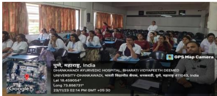
5. Faculty, PG scholars and other interns attending session