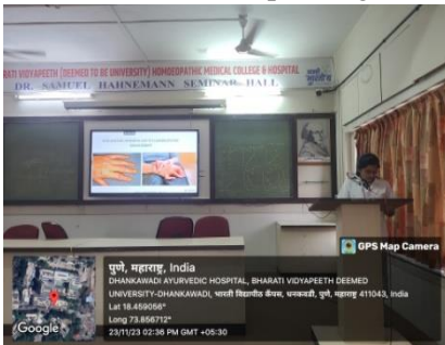
4. Divya wable explaining RA