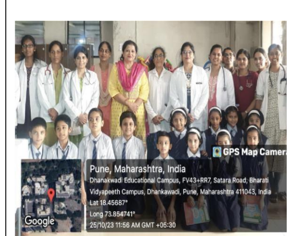
Screening Program- Group photo of faculty doctors, PG scholars and Interns with school students