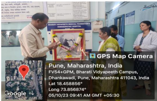
Inauguration of Camp By I/C Principal & Faculty members of Repertory Dept