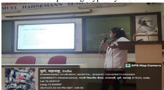
Shriyaa explaining Homeopathic approach