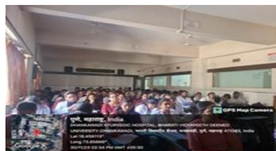
Faculty, PG scholars & other Interns attending session