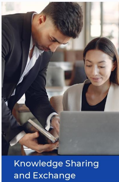
Knowledge Sharing and Exchange