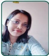
Coordinator Head HR ERC-India