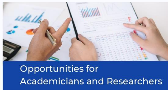
Opportunities for Academicians and Researchers