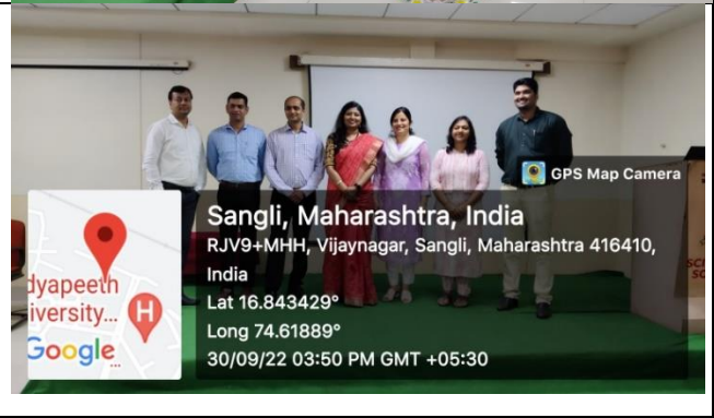
GPS Map Camera Sangli, Maharashtra, India RJV9+MHH, Vijaynagar, Sangli, Maharashtra 416410, India Lat 16.843429° Long 74.61889° 30/09/22 03:50 PM GMT +05:30