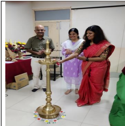
GPS Map Camera Sangli, Maharashtra, India RJV9+MHH, Vijaynagar, Sangli, Maharashtra 416410, India Lat 16.843399° Long 74.61894° 30/09/22 03:07 PM GMT +05:30