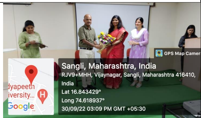
GPS Map Camera Sangli, Maharashtra, India RJV9+MHH, Vijaynagar, Sangli, Maharashtra 416410, India Lat 16.843429° Long 74.618937° 30/09/22 03:09 PM GMT +05:30