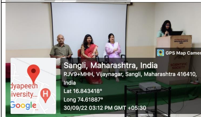
GPS Map Camera Sangli, Maharashtra, India RJV9+MHH, Vijaynagar, Sangli, Maharashtra 416410, India Lat 16.843418° Long 74.61887° 30/09/22 03:12 PM GMT +05:30