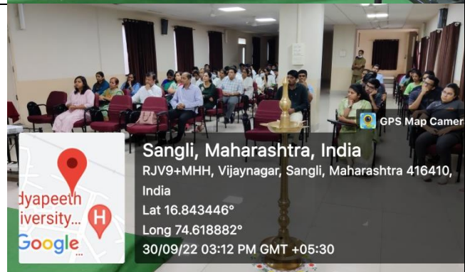
GPS Map Camera Sangli, Maharashtra, India RJV9+MHH, Vijaynagar, Sangli, Maharashtra 416410, India Lat 16.843446° Long 74.618882° 30/09/22 03:12 PM GMT +05:30