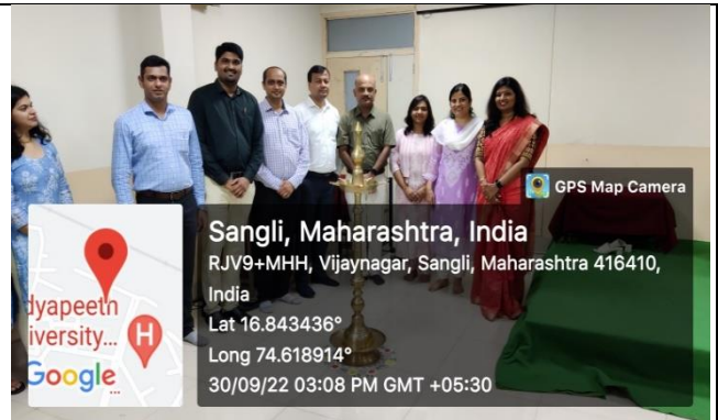
GPS Map Camera Sangli, Maharashtra, India RJV9+MHH, Vijaynagar, Sangli, Maharashtra 416410, India Lat 16.843436° Long 74.618914° 30/09/22 03:08 PM GMT +05:30