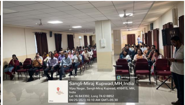
Sangli-Miraj Kupwad, MH, India Vijay Nagar, Sangli-Miraj Kupwad, 416415, MH, India Lat 16.843392, Long 74.618852 04/25/2023 10:10 AM GMT+05:30