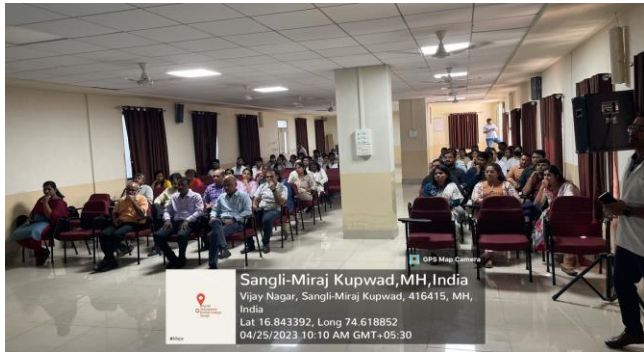
Sangli-Miraj Kupwad, MH, India Vijay Nagar, Sangli-Miraj Kupwad, 416415, MH, India Lat 16.843392, Long 74.618852 04/25/2023 10:10 AM GMT+05:30