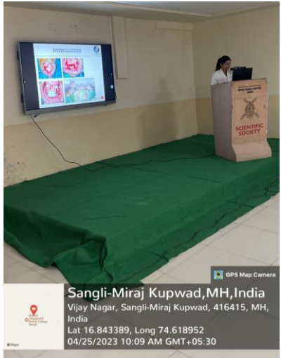
Sangli-Miraj Kupwad, MH, India Vijay Nagar, Sangli-Miraj Kupwad, 416415, MH, India Lat 16.843389, Long 74.618952 04/25/2023 10:09 AM GMT+05:30