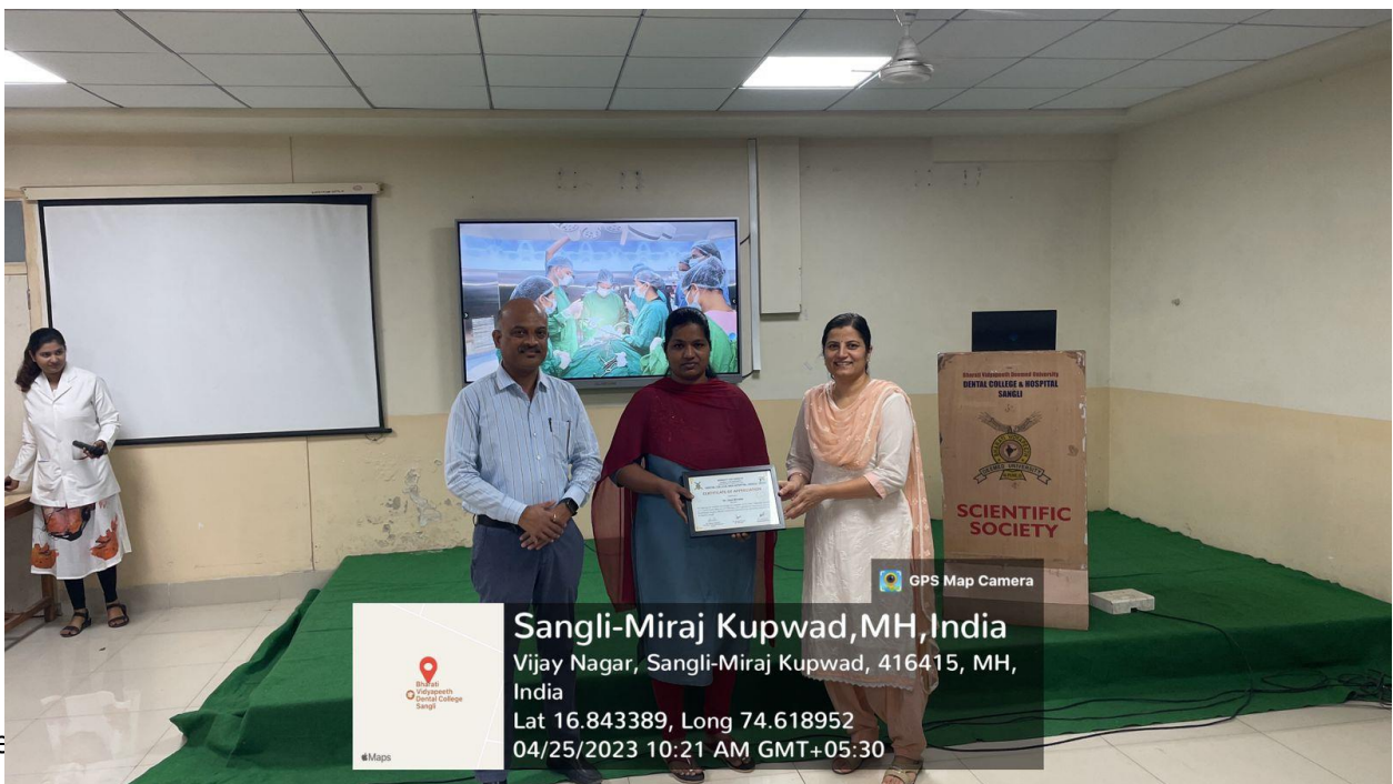
Sangli-Miraj Kupwad, MH, India Vijay Nagar, Sangli-Miraj Kupwad, 416415, MH, India Lat 16.843389, Long 74.618952 04/25/2023 10:21 AM GMT+05:30