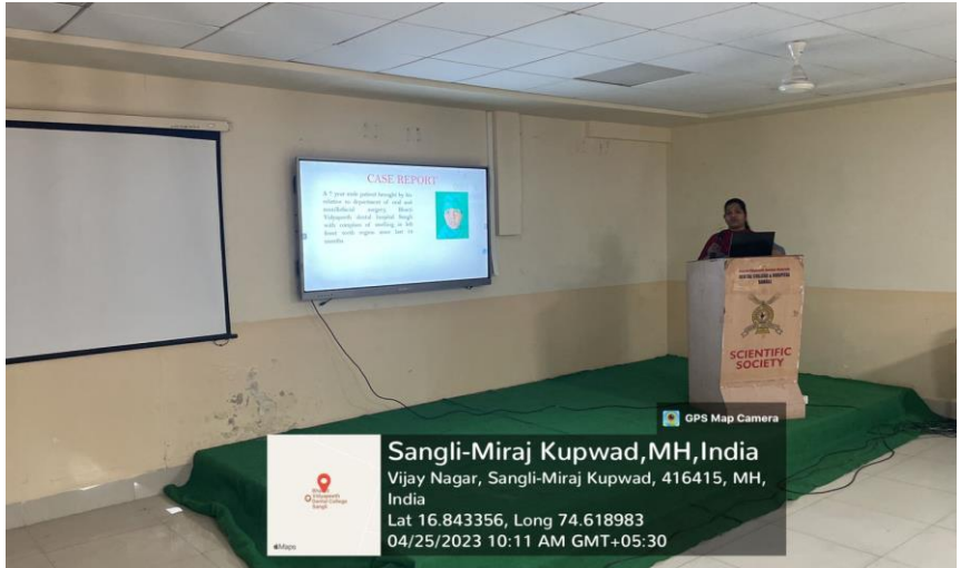
Sangli-Miraj Kupwad, MH, India Vijay Nagar, Sangli-Miraj Kupwad, 416415, MH, India Lat 16.843356, Long 74.618983 04/25/2023 10:11 AM GMT+05:30