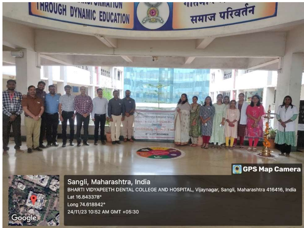
Dignitaries attended the programme of communal harmony day