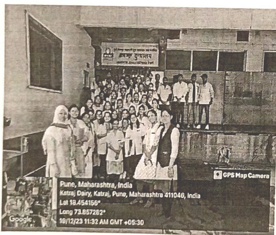
Figure 1 katraj dairy visit Term III IV BHMS

At the end of the visit open discussion was done to discuss and solve the queries of the students.