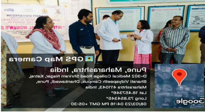
Distribution of chocolates as token of Appreciation