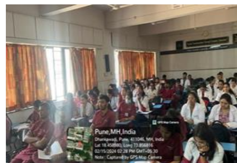
Interns & PG Audience