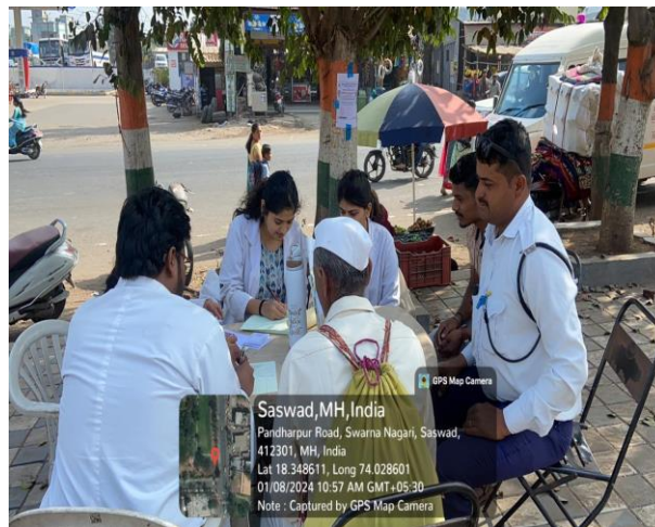
Dept. of Homoeopathic Pharmacy PG scholars examining the patients in the camp on 8th Jan2024 conducted at Saswad