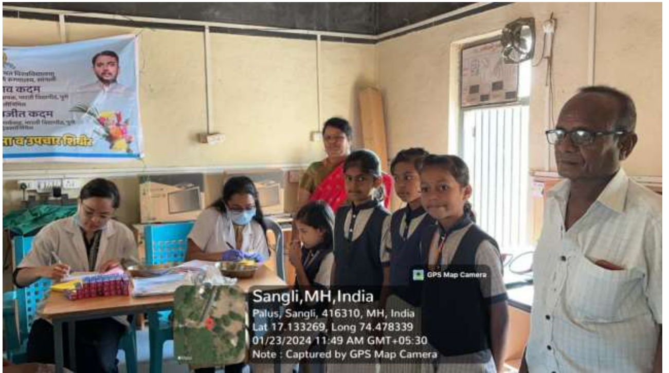
Sangli, MH, India Palus, Sangli, 416310, MH, India Lat 17.133269, Long 74.478339 01/23/2024 11:49 AM GMT+05:30 Note : Captured by GPS Map Camera