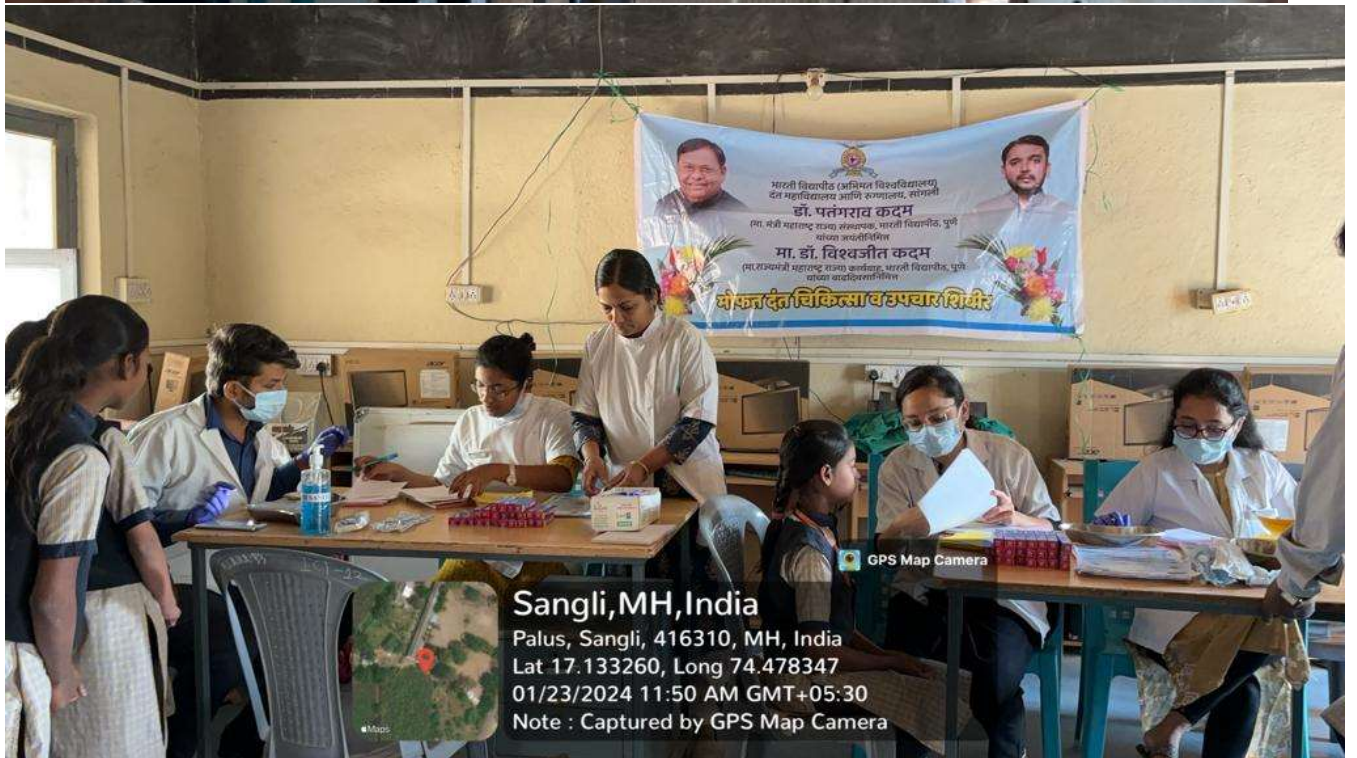
Sangli, MH, India Palus, Sangli, 416310, MH, India Lat 17.133260, Long 74.478347 01/23/2024 11:50 AM GMT+05:30 Note : Captured by GPS Map Camera