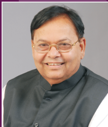
Dr. PATANGRAO KADAM