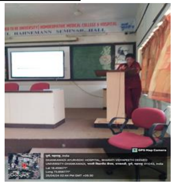
Intern Purwa Presented the case of Mumps