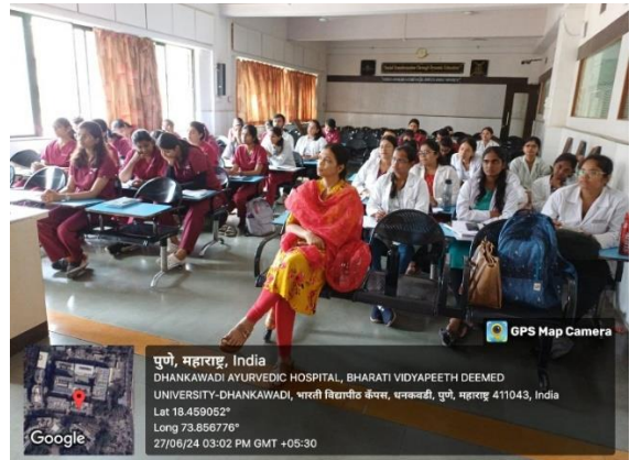
Interns, PG scholars and DRVVP attending the session