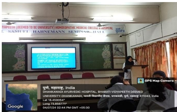
Intern Anum presenting condition Chikungunya