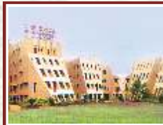
College of Engineering, Kolhapur