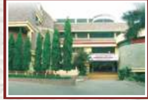
Yashwantrao Mohite College of Arts, Science & Commerce, Pune