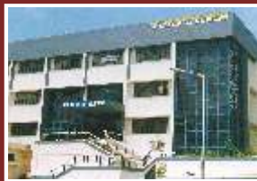
College of Nursing, Pune