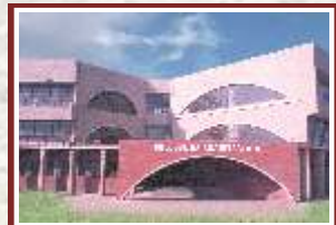
College of Architecture, Pune