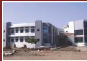
College of Nursing, Sangli