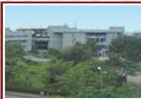
College of Engineering, Pune