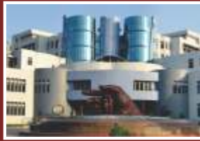
Medical College & Hospital, Sangli