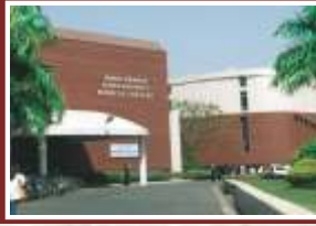
Medical College, Pune.