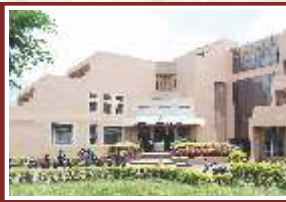
Institute of Management, Kolhapur