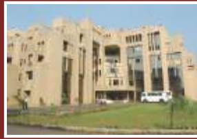
Dental College & Hospital, Navi Mumbai