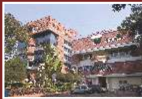
Poona College of Pharmacy, Pune