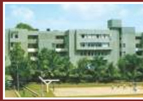
Institute of Management & Entrepreneurship Development, Pune