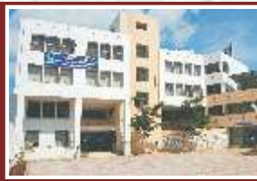
Abhijit Kadam Institute of Management & Social Sciences, Solapur