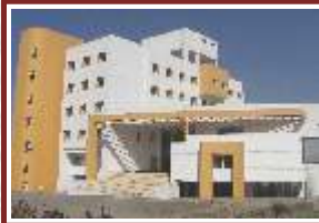
Rajiv Gandhi Institute of Information Technology & Biotechnology, Pune