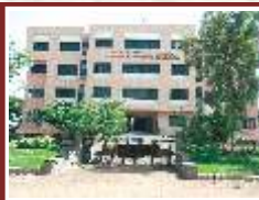
College of Physical Education, Pune