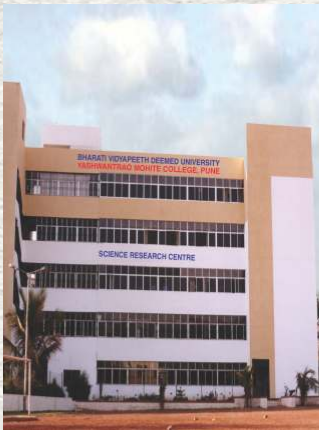
Science Research Centre