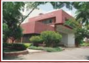
Homoeopathic College, Pune