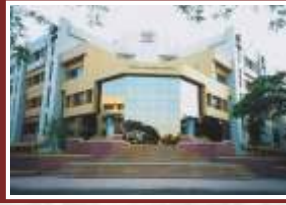
Dental College & Hospital, Pune