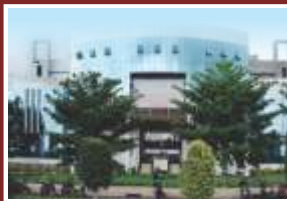
Dental College & Hospital, Sangli