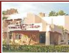
Yashwantrao Mohite Institute of Management, Malakpur-Karad