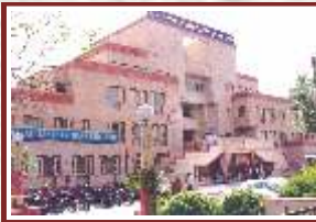
Institute of Management & Research, New Delhi