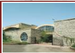
Institute of Environment Education & Research, Pune