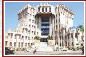
Institute of Management & Rural Development administration, Sangli