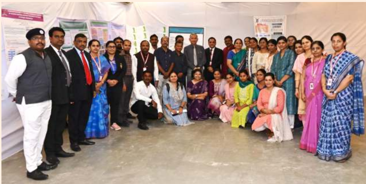
04-07-2024: Hon. VC & the Core Team visited the Research Posters presentation by Ph. D. Students