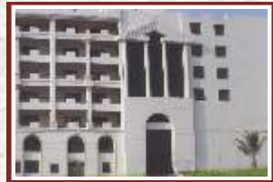
Social Sciences Centre, Pune