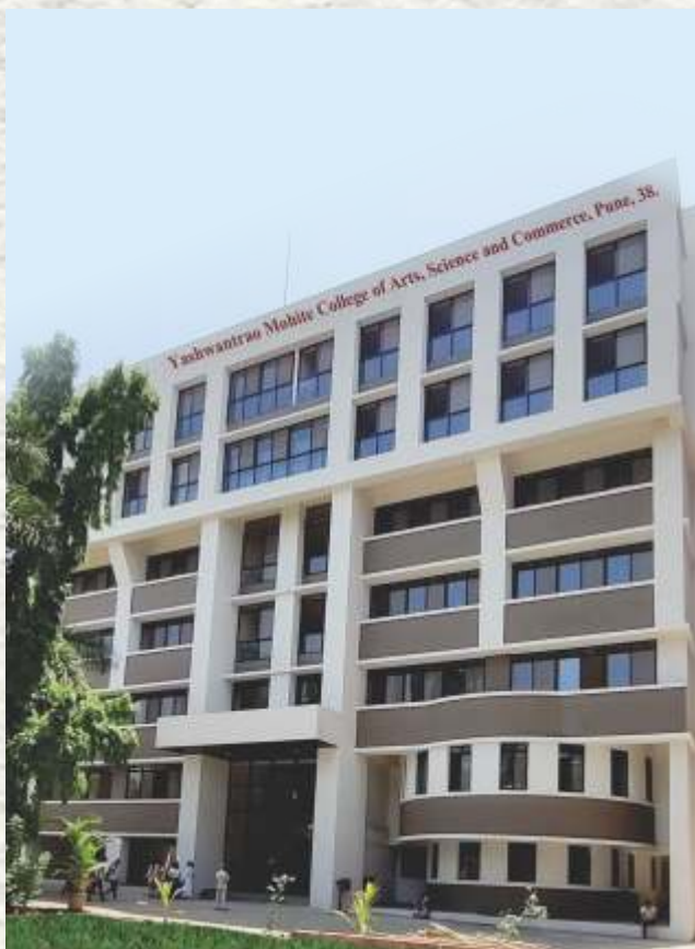
New Extension Building