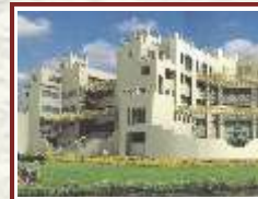
College of Engineering, Navi Mumbai