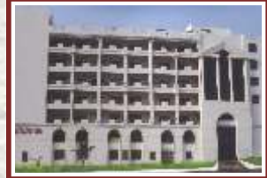
New Law College, Pune