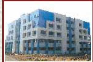
College of Nursing, Navi Mumbai