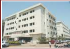
Bharati Hospital, Pune