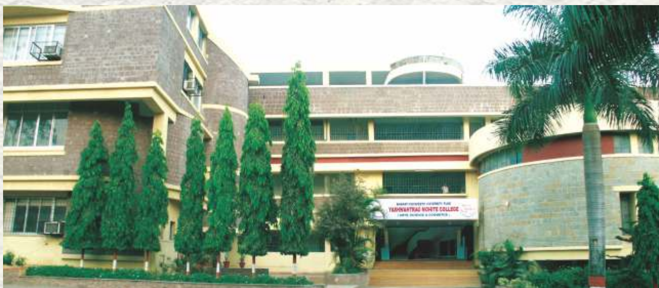
Y M College main building