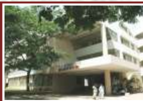
College of Ayurved, Pune