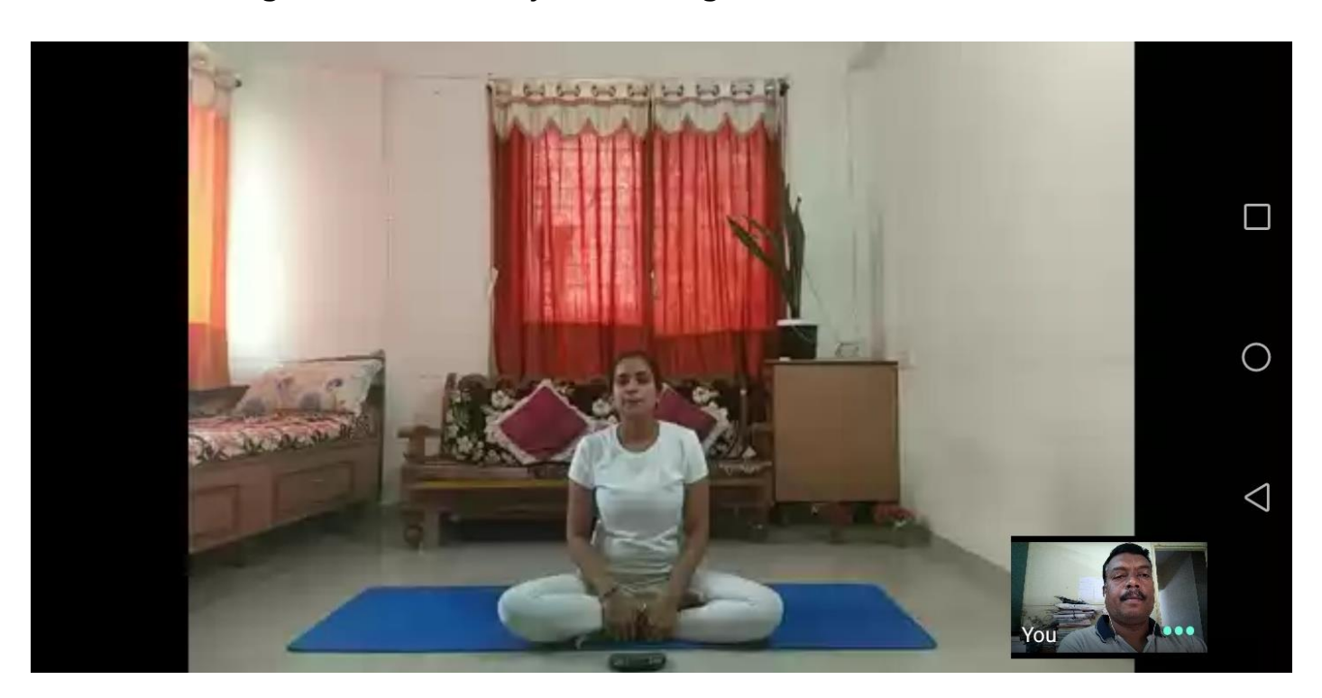
NSS Volunteers Campaigning During Corona Pandemic :