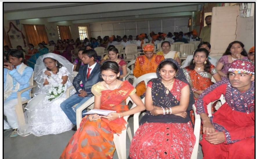
Students in Traditional Dresses when National Unity Day was Celebrated