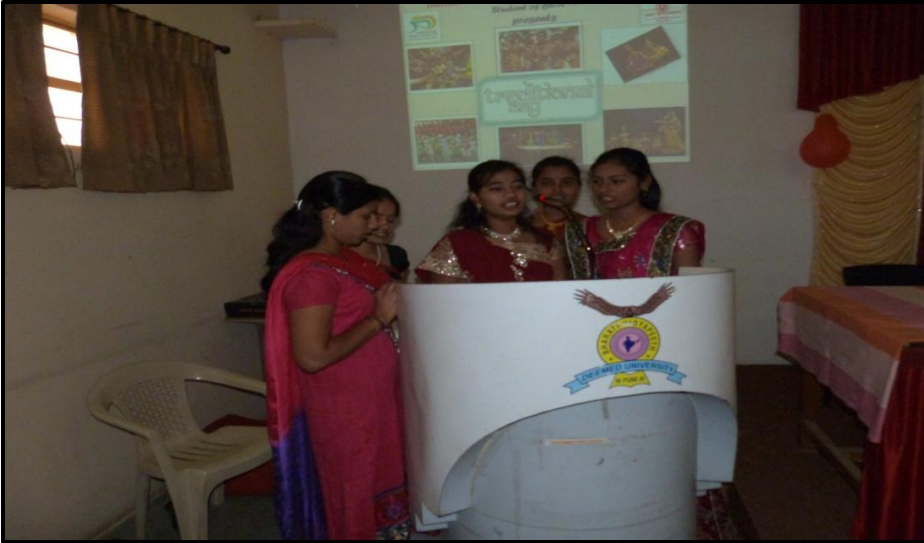
NSS Volunteers Presenting NSS Song at Celebrations of National Unity Day