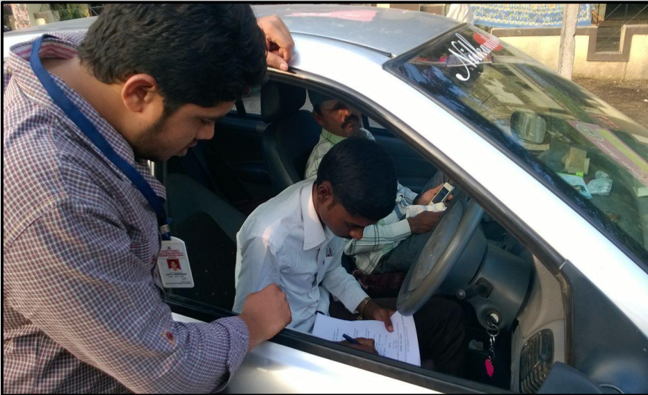
Survey on Awareness of Road Safety and Traffic Rules by NSS Volunteers