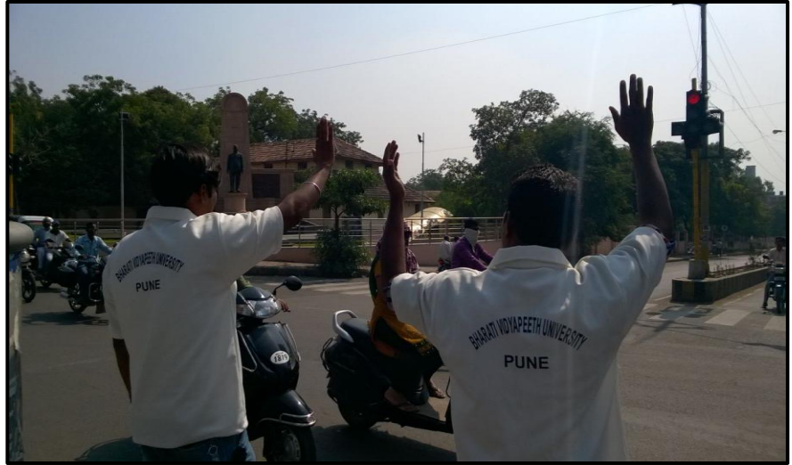
Traffic Control By NSS Volunteers