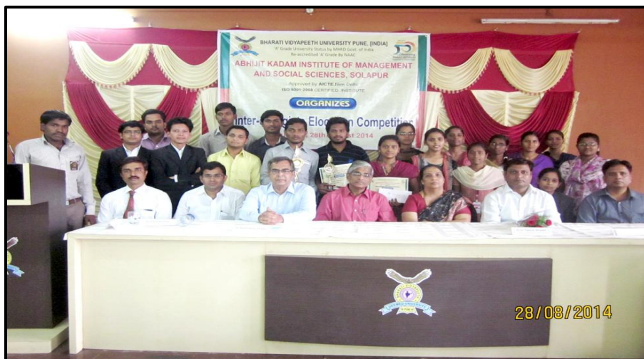
Winners and Participants of Intercollegiate Elocution Competition with Director, Judges and Staff members