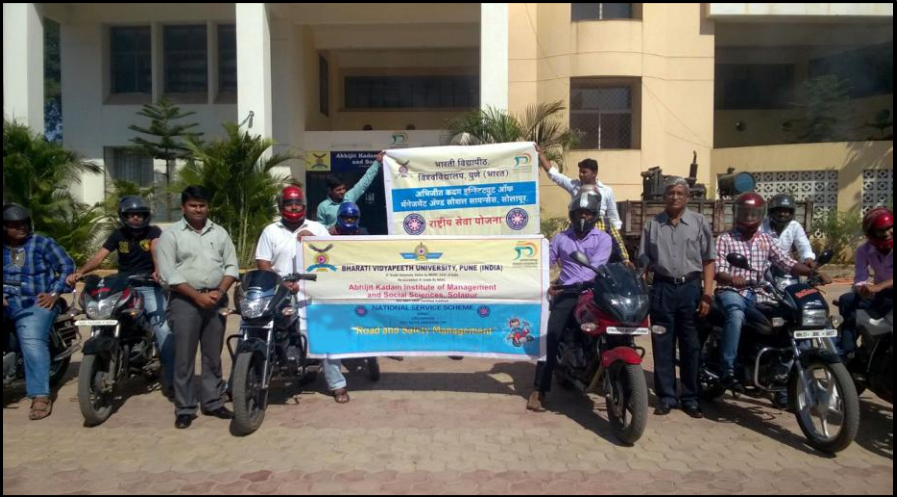
Helmet Awareness Rally