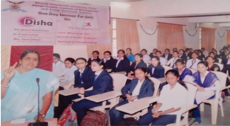
Awareness Lecture “Disha” for Girls