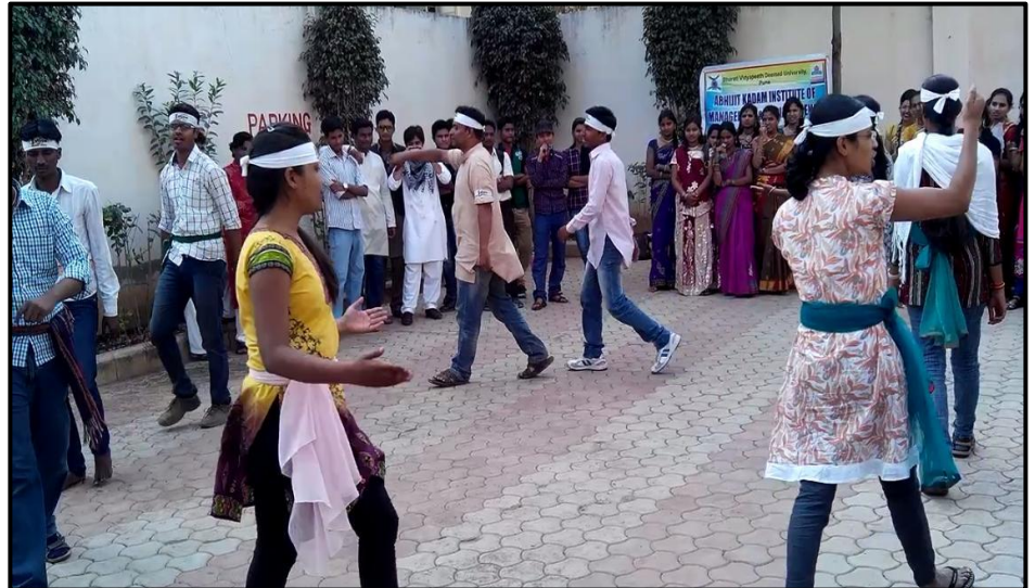
Street Play on Road Safety Awareness by NSS Volunteers