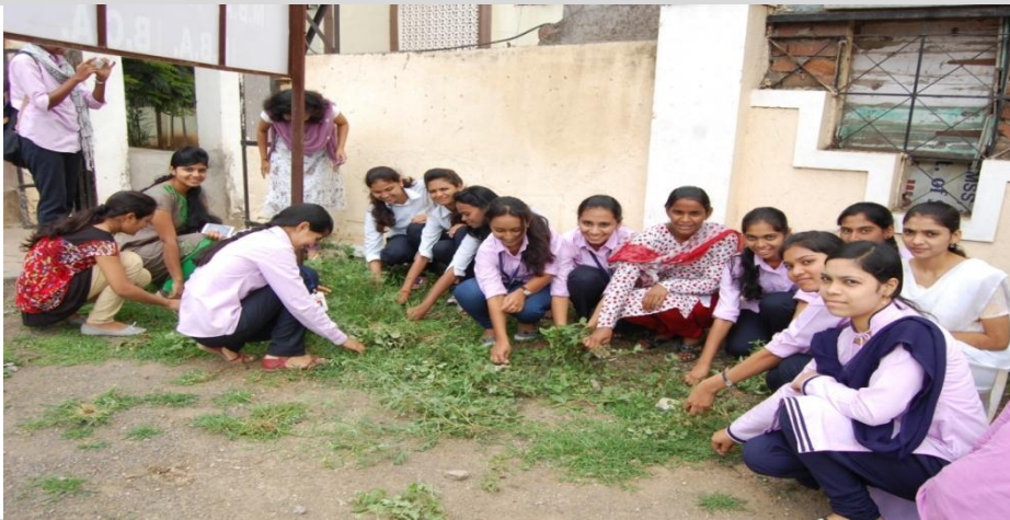
Cleanness Campaign by NSS Volunteers