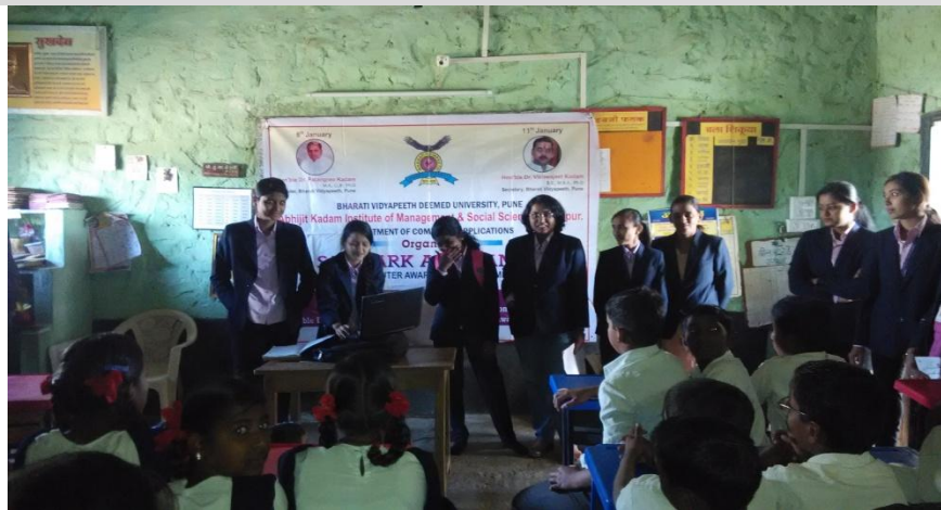
Computer Training at Z.P. Schools by NSS Volunteers