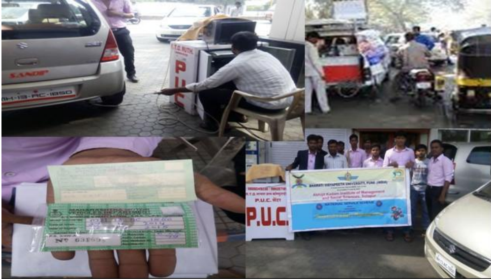
PUC Checkup Camp