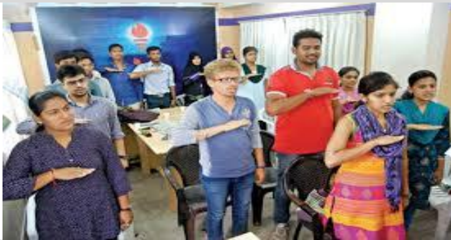
Students Taking Pledge of Unity