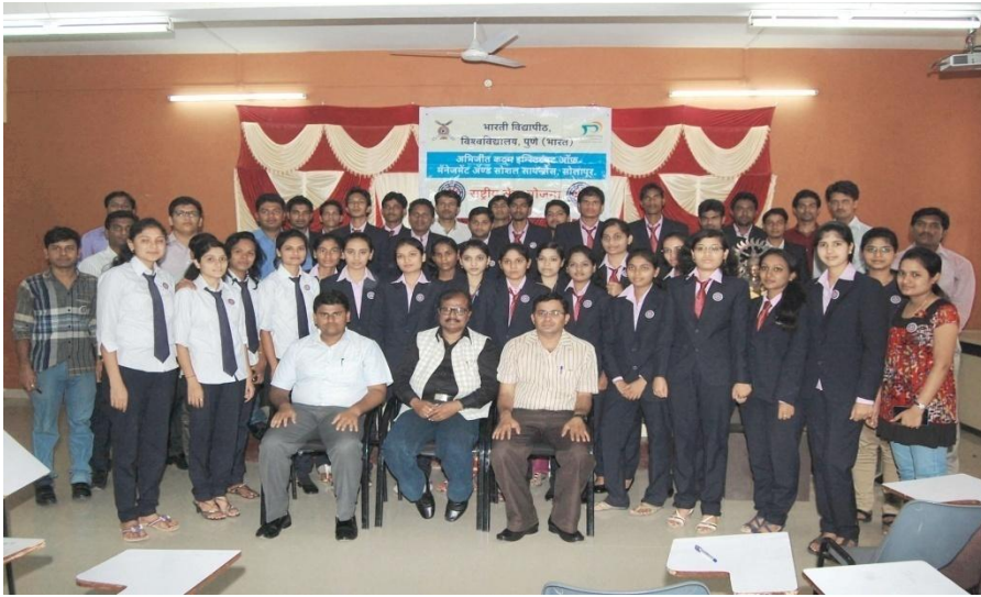
Orientation Programme of NSS Batch 2014-15