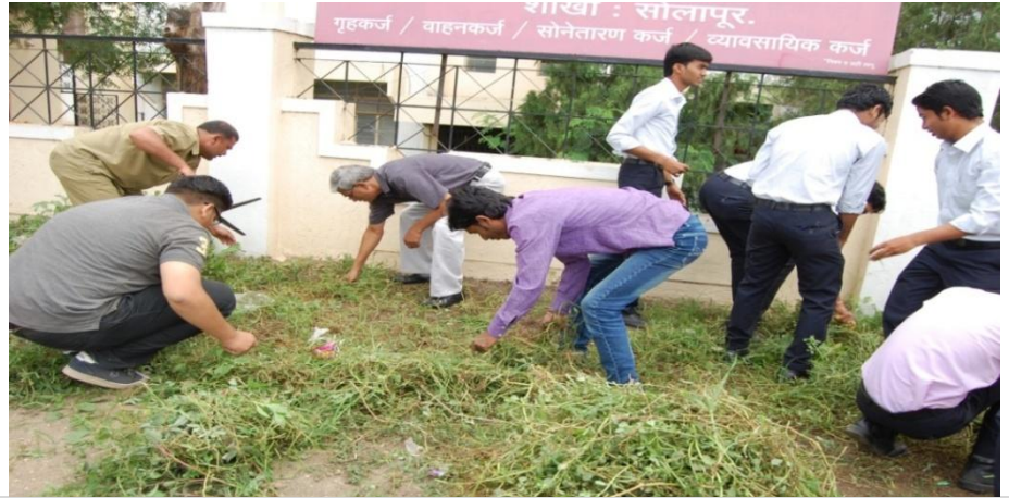
Cleanness Campaign by NSS Volunteers