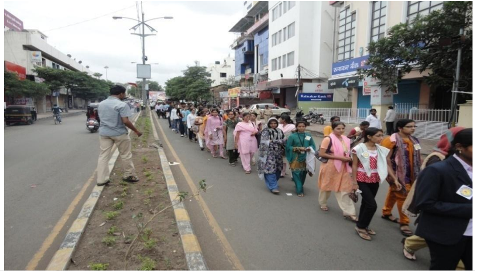
Students and NSS Volunteers participated in Run for Unity organized by Kendriya Vidyalaya Central Railway, Solapur