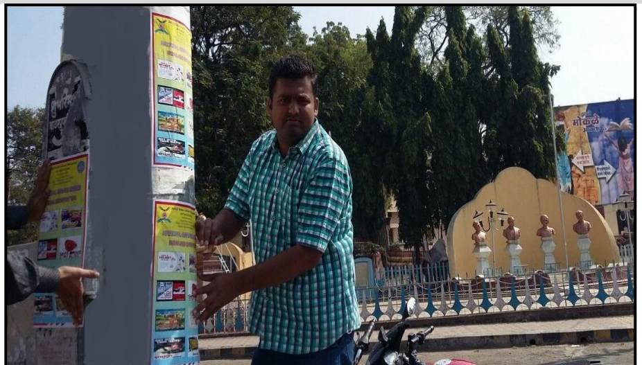
Awareness of Road Safety and Traffic Rules through Posters by NSS Volunteers