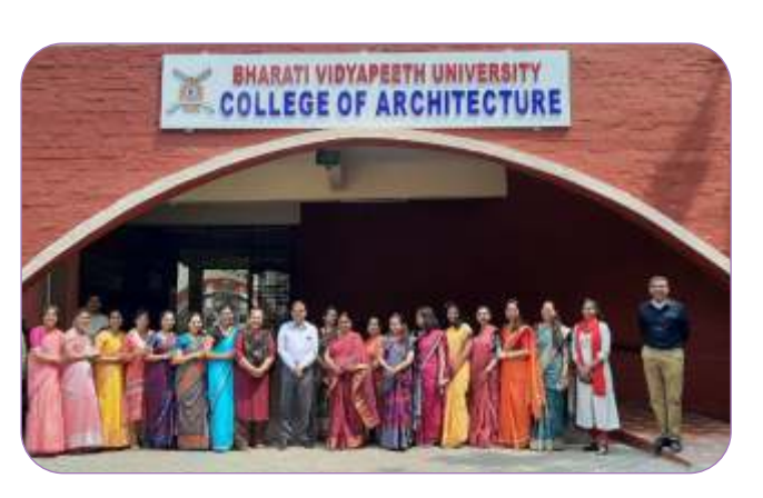
EXPERIENCED AND QUALIFIED FACULTY