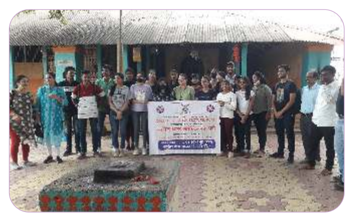
NSS Winter Camp -2022