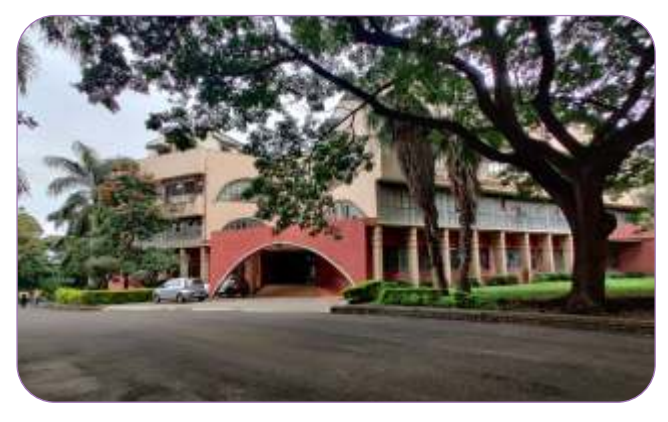
PLEASENT LUSH GREEN COLLEGE SURROUNDINGS