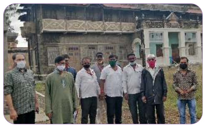
PROFESSIONAL CONSULTANCY FOR NGO & RURAL DEVELOPMENT AND PLANNING