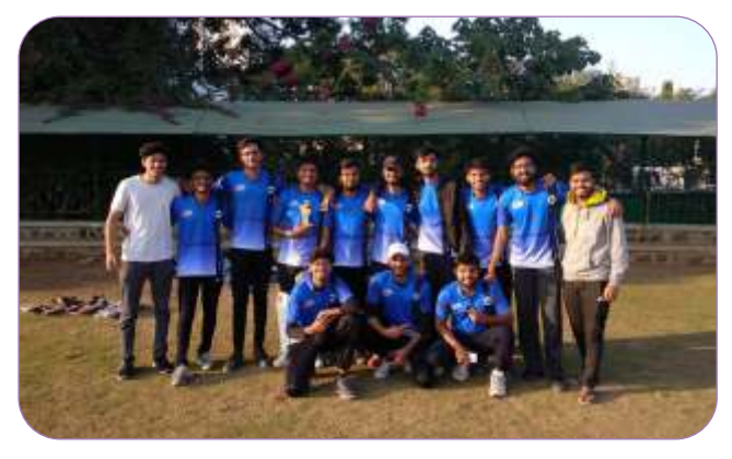
STUDENTS PARTICIPATION IN INTER-UNIVERSITY SPORTS