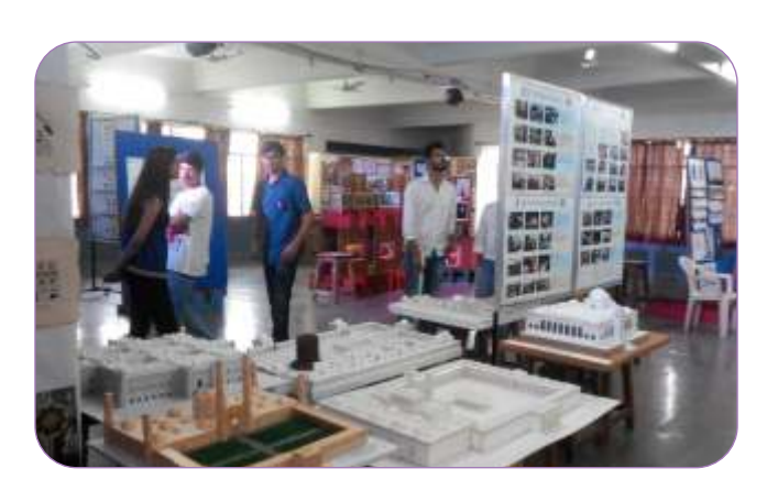
STUDENTS ACADEMIC WORK EXHIBITION