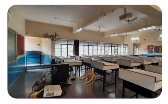
SPACIOUS WELL EQUIPPED CLASSROOMS