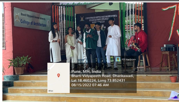
Flag hoisting ceremony at College of Architecture, Pune NSS volunteers, staff and students singing patriotic songs