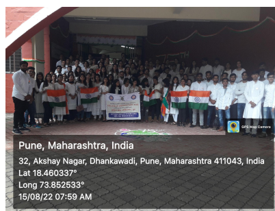
Flag hoisting ceremony at College of Architecture, Pune NSS volunteers, Students and staff group photo