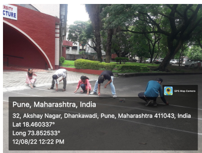
NSS volunteers working for marking foreground for participants to stand for flag hoisting ceremony