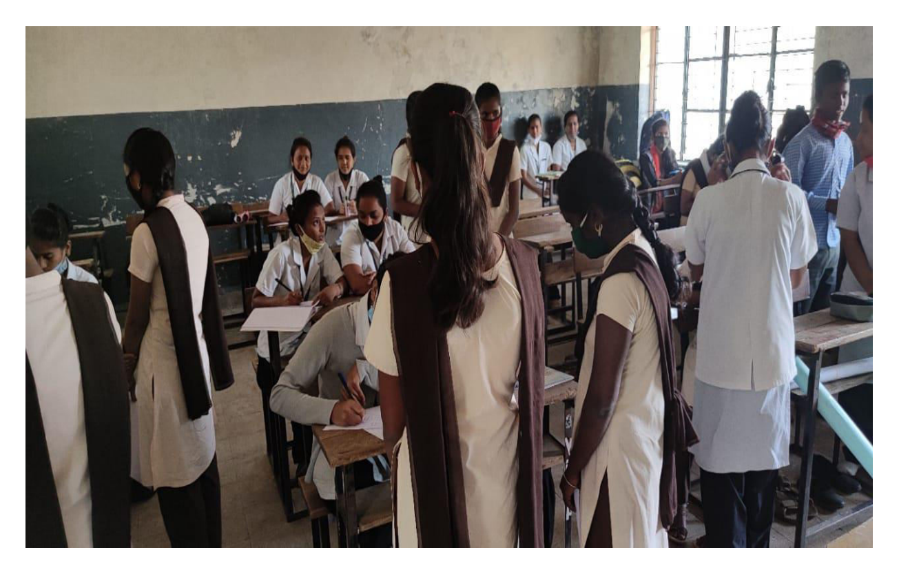
School Health Check-up