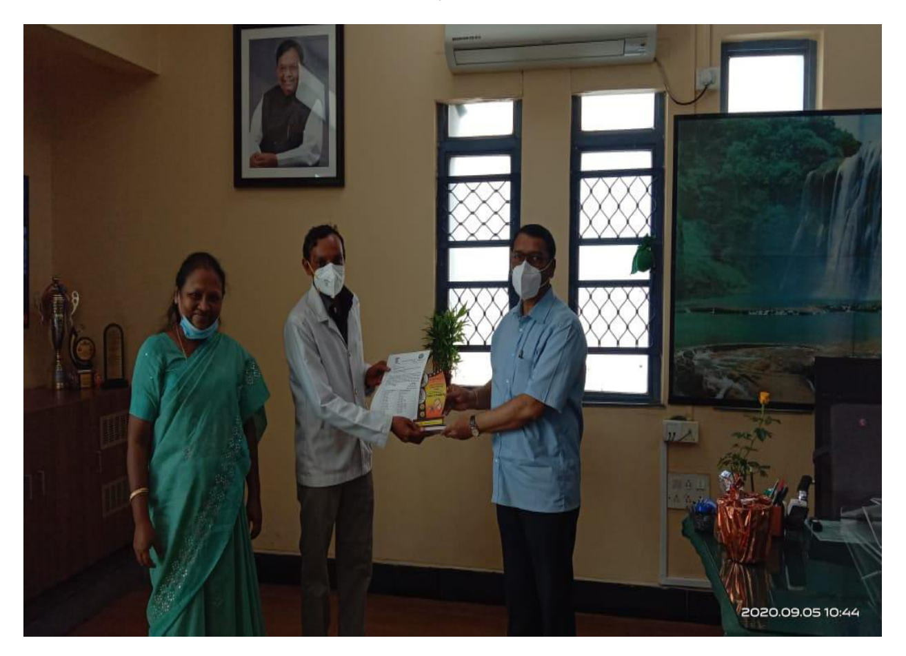
Award with momentum as a COVID warrior