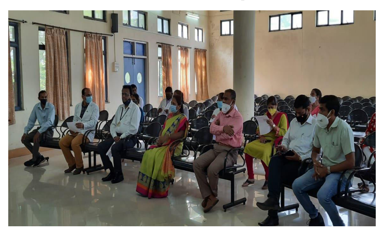
Guest Lecture on Anti-Ragging measures