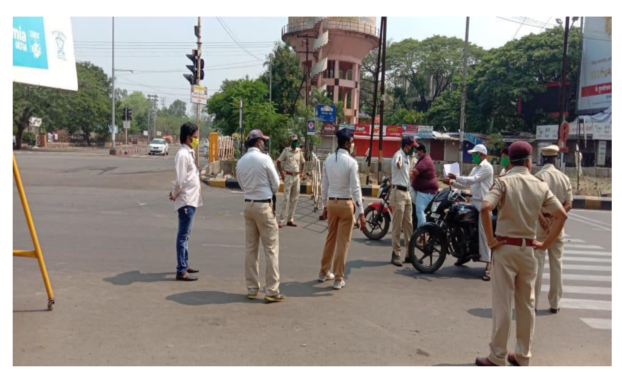
Work as a COVID Warrior to help the sangli Police