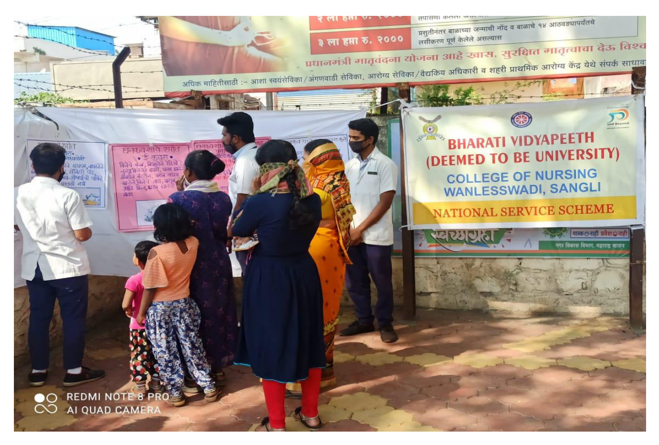
Health Exhibition on Domestic Waste management