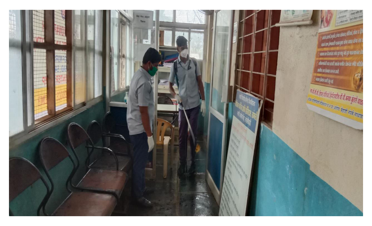
Sanitize the Primary Health Centre, Sangliwadi