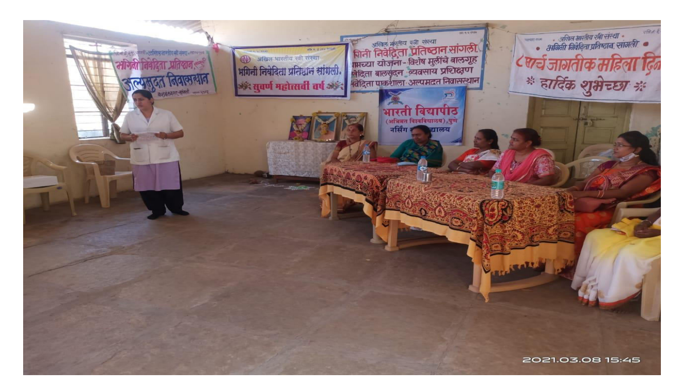
Women's Day Celebration