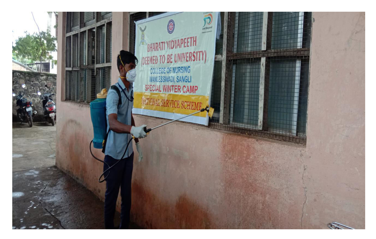
Sanitize the Primary Health Centre, Sangliwadi