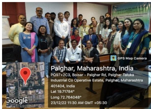
Visit to Dr. MLD Institute