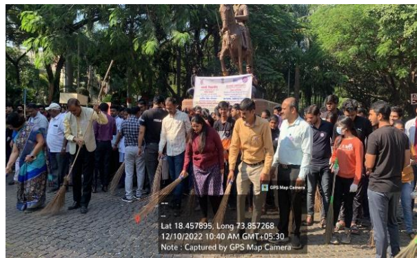
Cleaning started with all principals, Programme Officers and Students