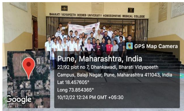
Around 200 kg plastic and other waste collected