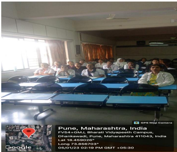
Staff, Interns and PG attending session