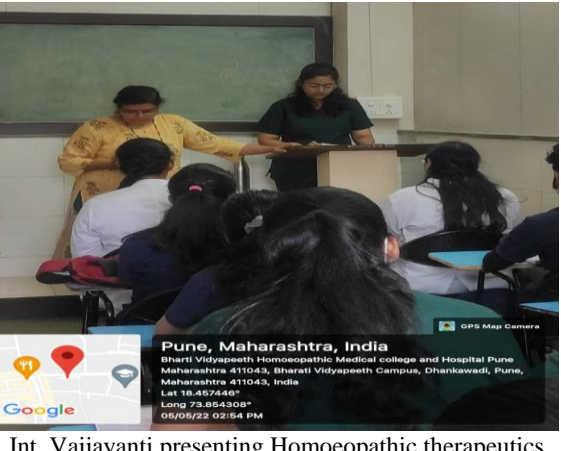
Int. Vaijayanti presenting Homoeopathic therapeutics of Uterine Fibroid