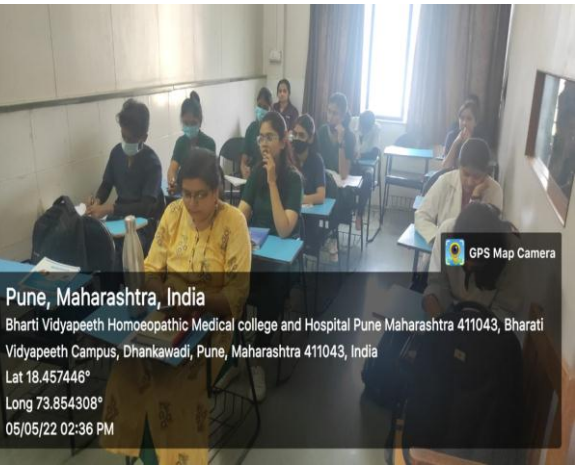
Audience for the session