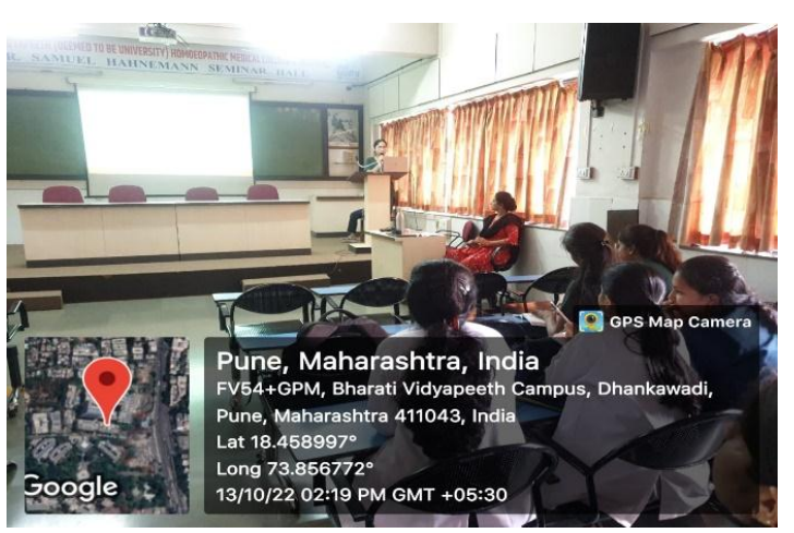
Staff and students attending clinical session