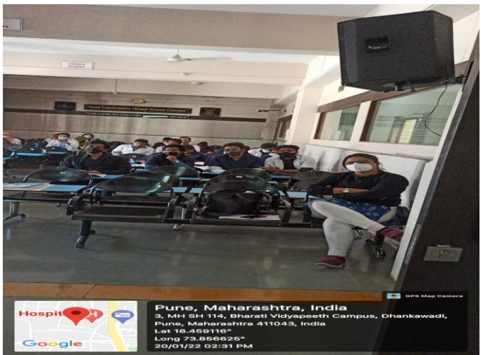
Interns and Pg Scholars attending the session,