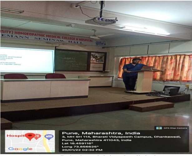
1ntern Rakesh explaining the clinical part.