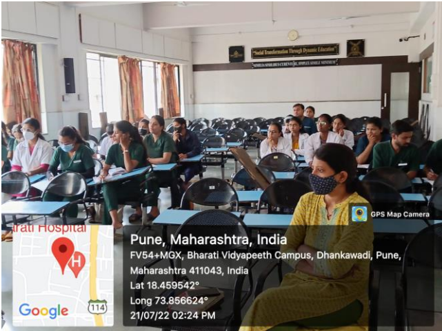
Faculty and students attending session