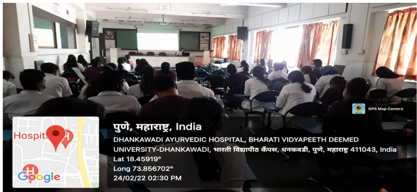
Interns and P.G.Scholars attending the session