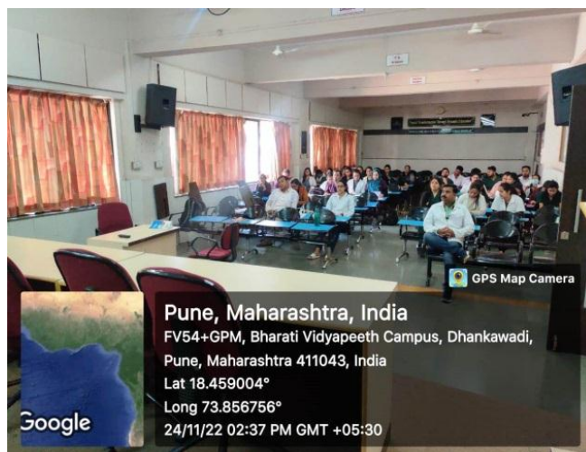
Students attending the clinical session