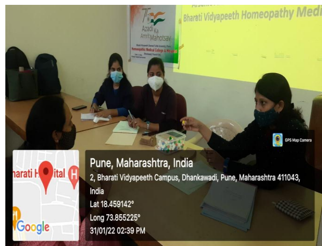
Distribution of Arsenic Album 30C