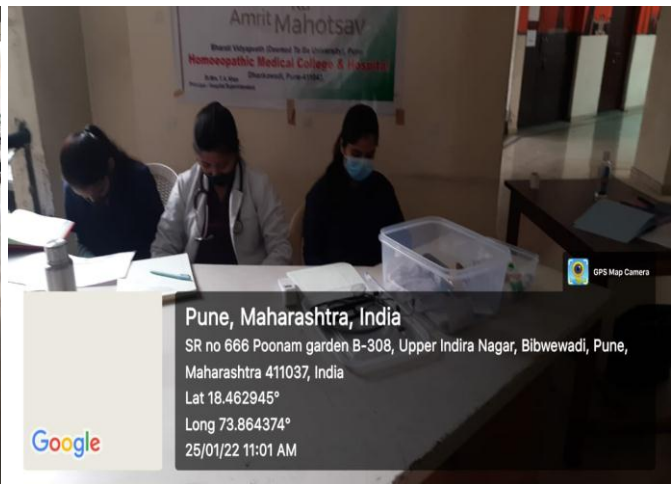
Distribution of Arsenic Album 30C