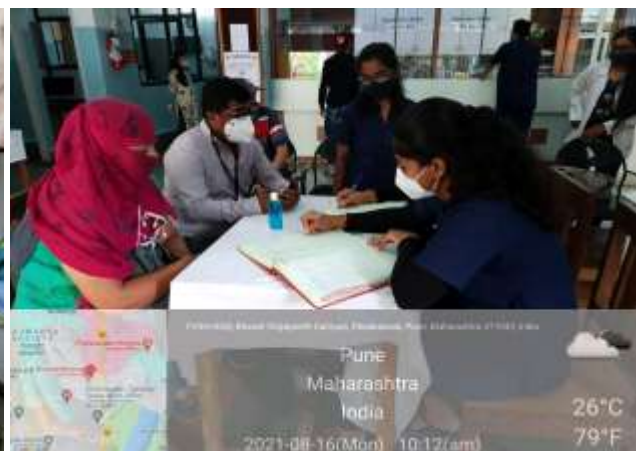
Patients at registration counter.