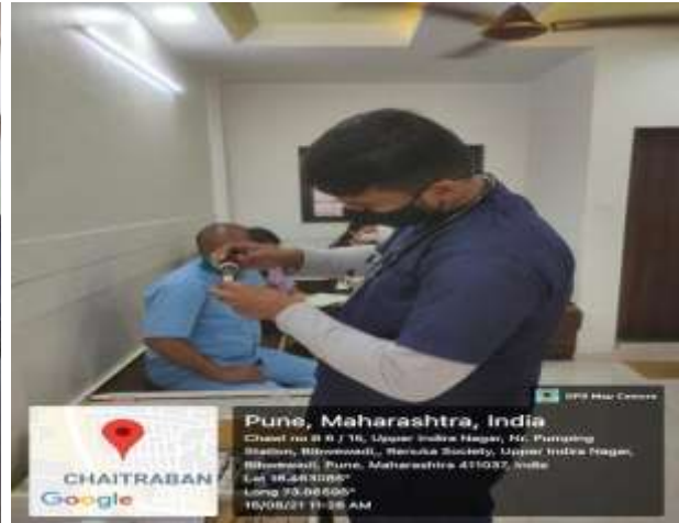
PG Scholars with the patient.