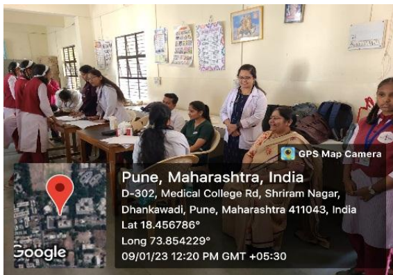
Hb% Screening by Doctors (Dept. of Organon)