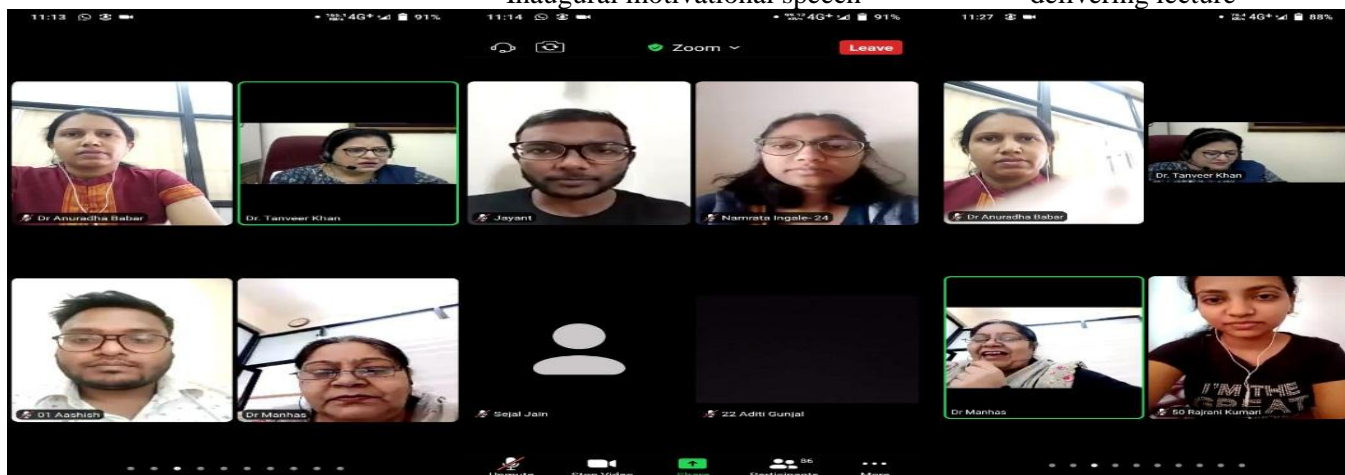
NSS Volunteers attending lecture