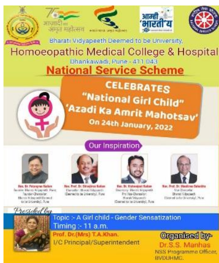
Brochure of event