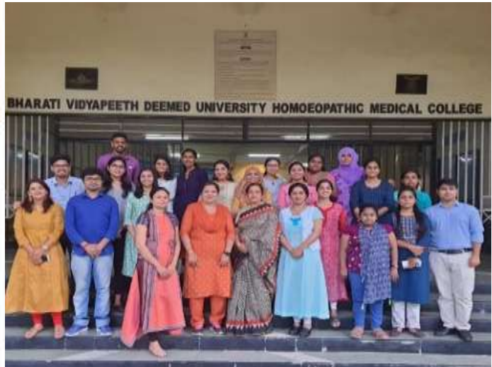
P.G. Scholars with Principal, Dean and Staff