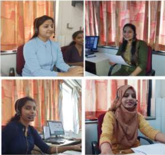
Anchoring for E- Poster Competition