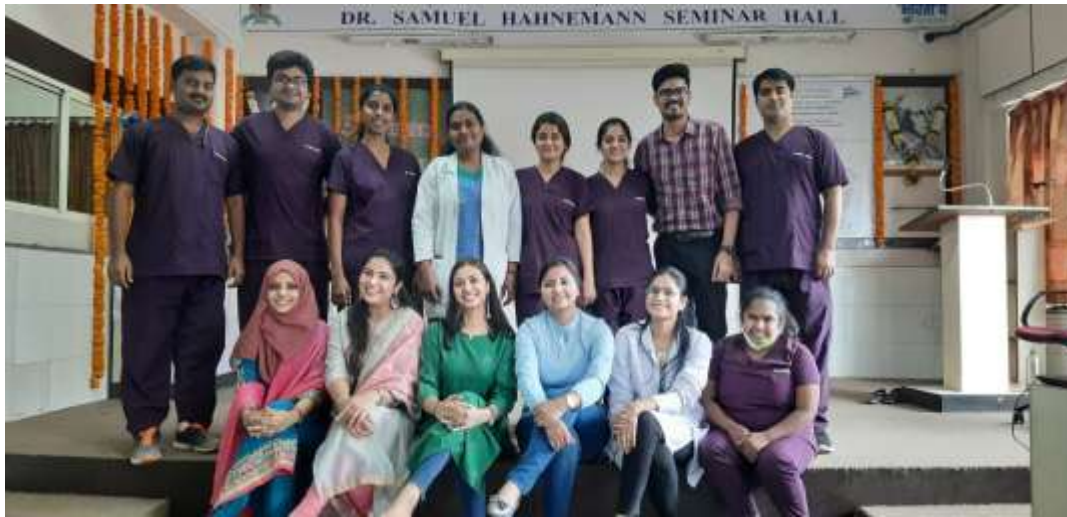
Committee members from 14 th batch P.G. scholars for research conclave 2021