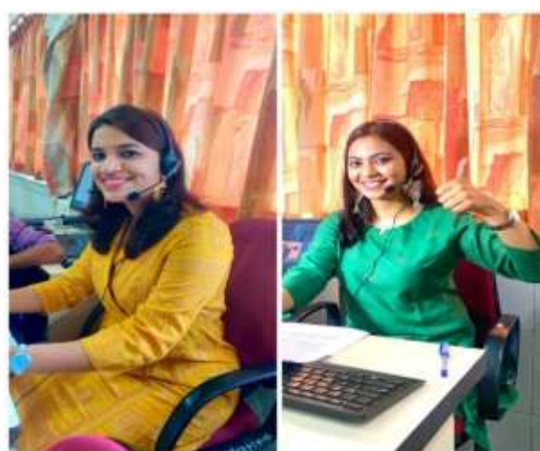
Anchoring for Workshop