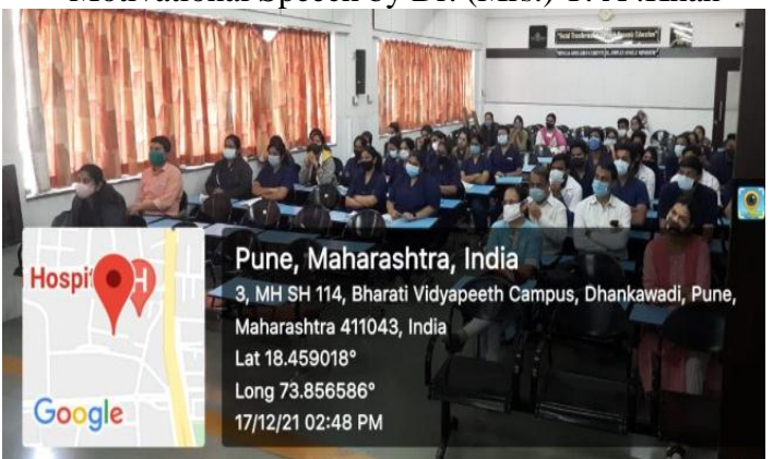
Interns and Faculty Present