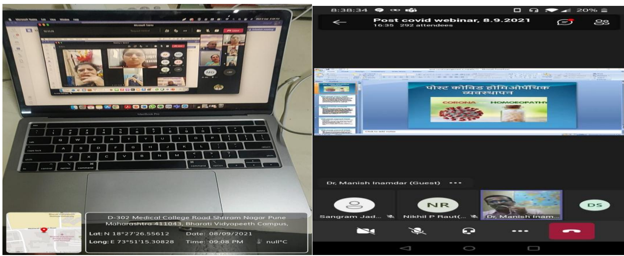
(GLIMPS INTO WEBINAR)