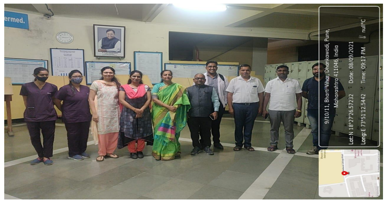
(BHARATI VIDYAPEETH POST COVID WEBINAR COMMITTEE MEMBERS)