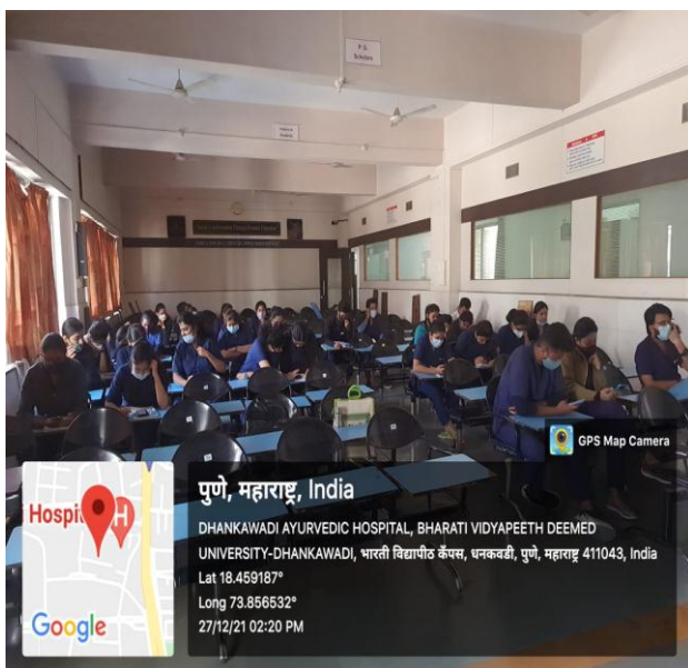
Interns attending the session