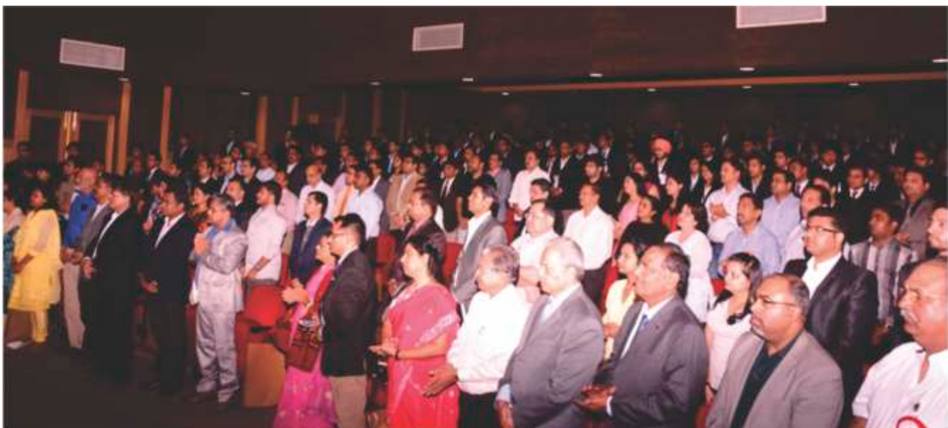
Gathering at IIPS 2014