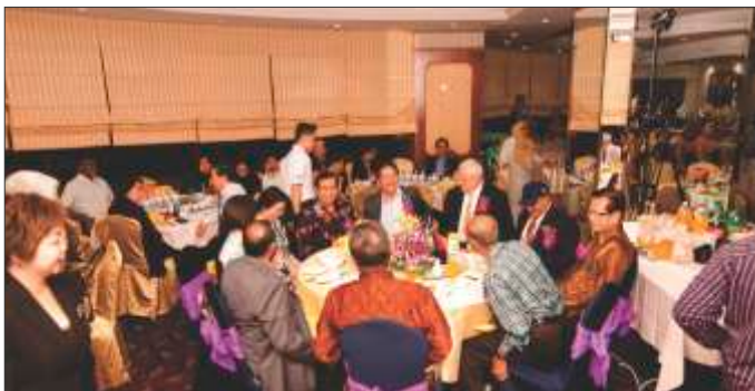
Audience participating in the International Symposium