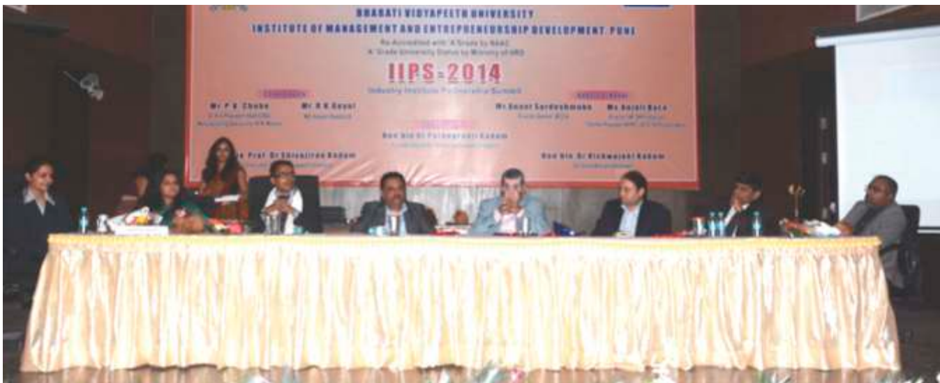
Panel Discussion on “Management Education.. the road ahead” at IIPS 2014.