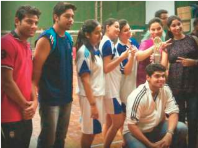
IMED Inter Collegiate Badminton Tournament Team

Girls' team stood 3rd in Inter Collegiate Badminton Tournament.