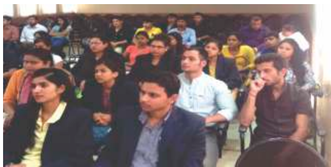
Students participating in the Guest lecture