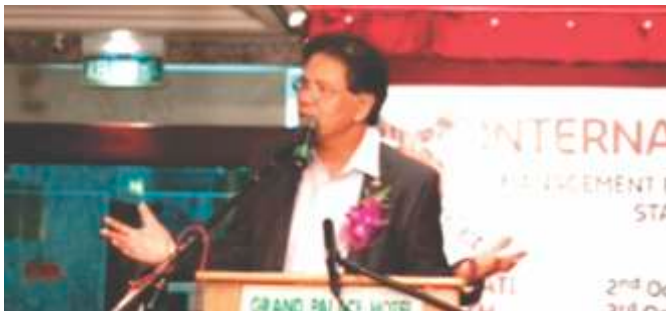
Hon'ble SriIdrisJala, Minister in The Malaysian Prime Minister's Department delivering inaugural speech on the subject: Management Education: Achieving Global Standard and Recognition.