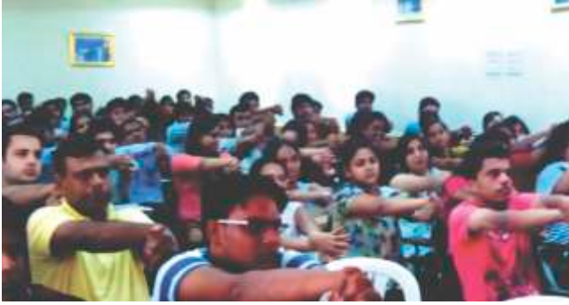
MBA MCA Students participating in the activity of Induction Program