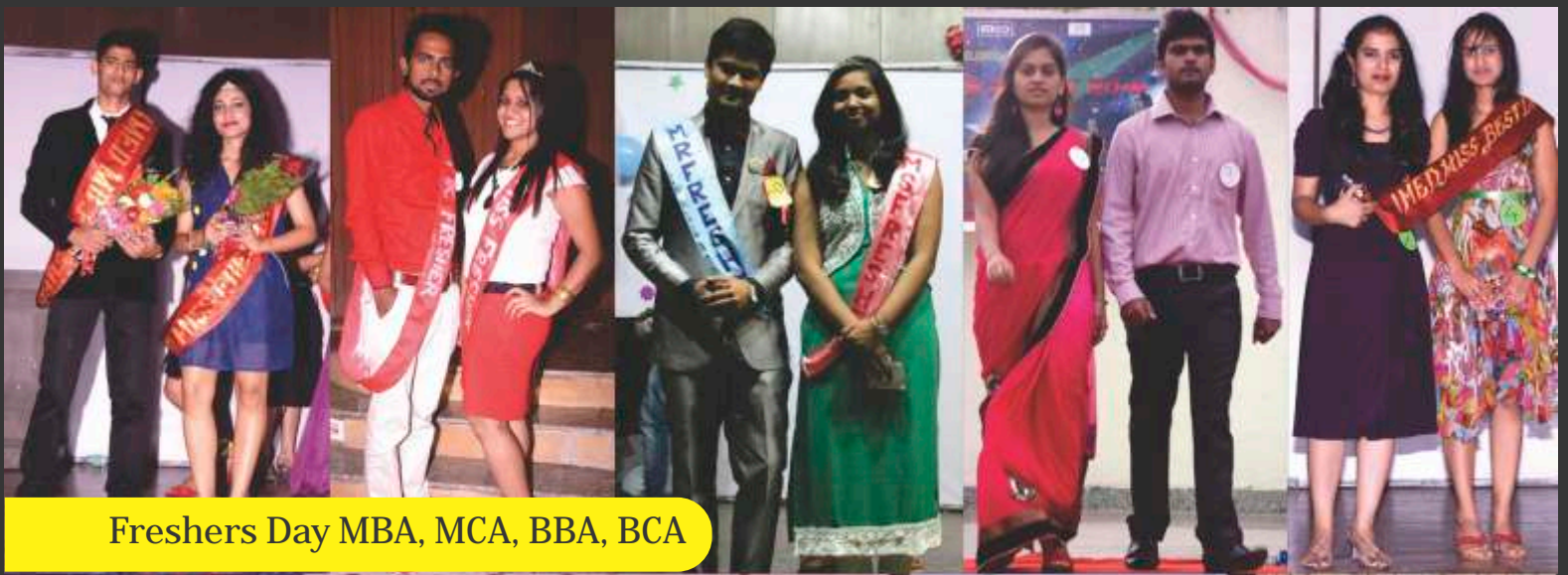
Freshers Day MBA, MCA, BBA, BCA